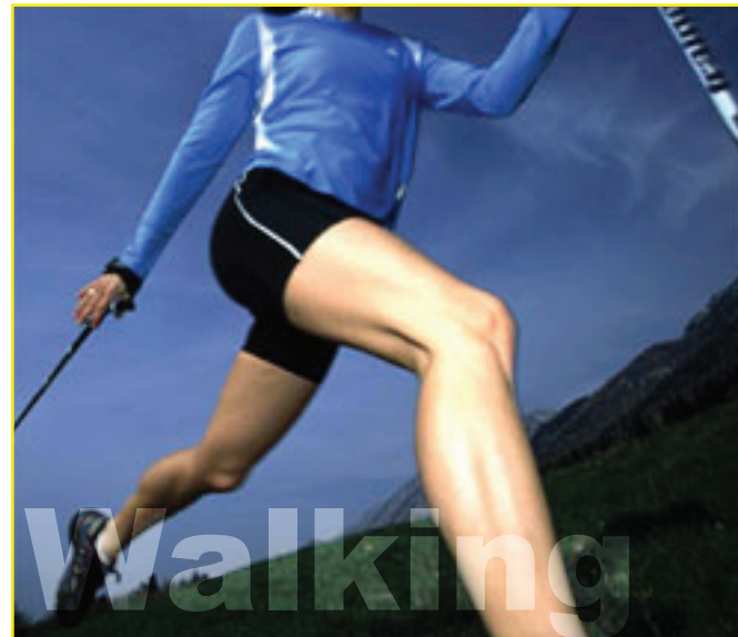
Nordic Walking www.nordicwalker.com